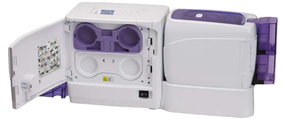
LAMINATOR / NUVIA (SINGLE HOPPER) / CRADLE