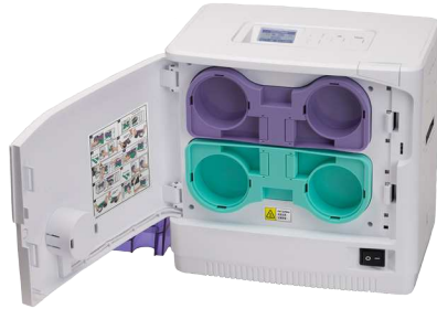
DUAL SIDED LAMINATOR