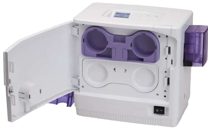
SINGLE SIDED LAMINATOR