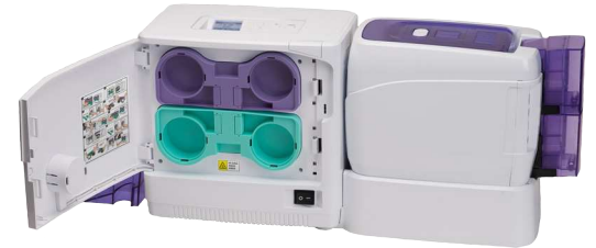
LAMINATOR / NUVIA (DUAL HOPPER) / CRADLE